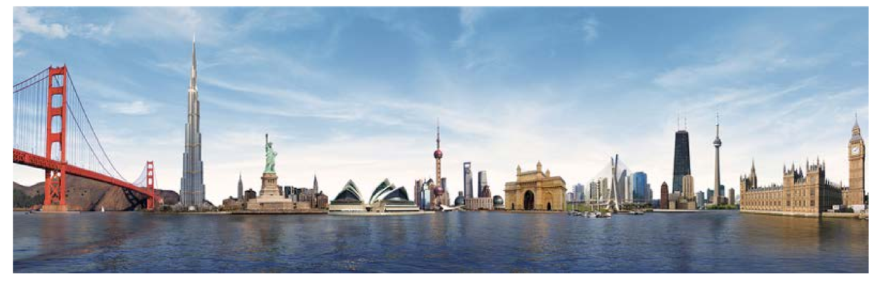
GSV Capital financial data as of 6/30/17; Market data as of 8/8/17, unless otherwise noted